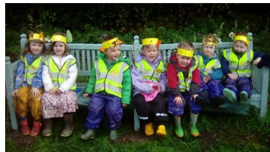
Wearing their crowns on the allotment

These countries relate to the children who attend the nursery , and we hope that through this project we will promote a sense of belonging, inclusion, parent participation as well as inciting a sense of adventure in us all. The release of 'Paddington 3' the movie is sheer happy coincidence!