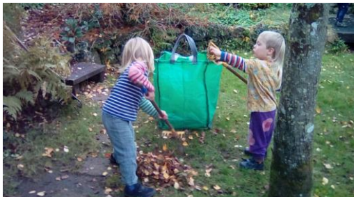
Teamwork when raking Autumn leaves

During the first half of this term, we have focussed on helping the children to settle in, establish friendships and routines . It has been lovely to see existing and new relationships blossoming amongst the children.